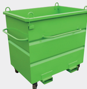
4 lifting lugs option bin on wheels