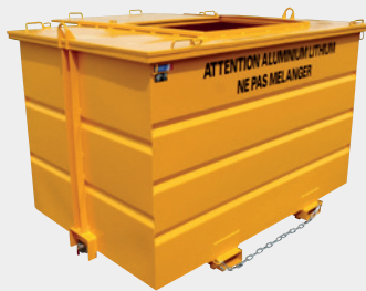
Customized lid with sliding gate