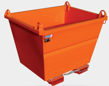
Special conical manufacture