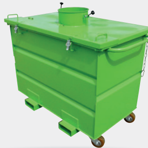
Free-standing lid with ferrule and inspection hatch