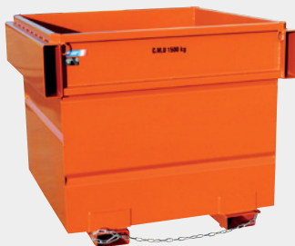
Catch carriage with clamps