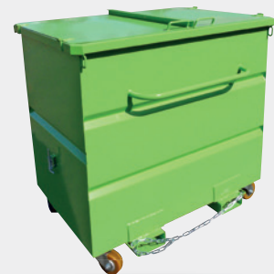
Hinged double lid